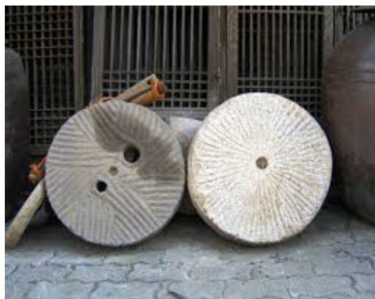
Figure 2. Patterns of millstones

When order forms in the psyche, geometrical patterns begin to form or, in other words, the Mandala appears. As shown in figures 2 and 3, we can find the patterns of a Mandala where the millstones fold. The pole at the center of the stones represents the axis that connects the conscious and the unconscious, or the ego and the Self. It can be said that the pole, as axis mundi, symbolizes the transcendental principle that connects the realm of the conscious and the realm of the unconscious into one. The pole can be viewed in comparison to the transcendent function of human unconsciousness, which can adjust those that are dangerous, stabilize those that whiffle, and resolve the conflict between the opposites and unite them into one (Lee, 2012, p. 601).