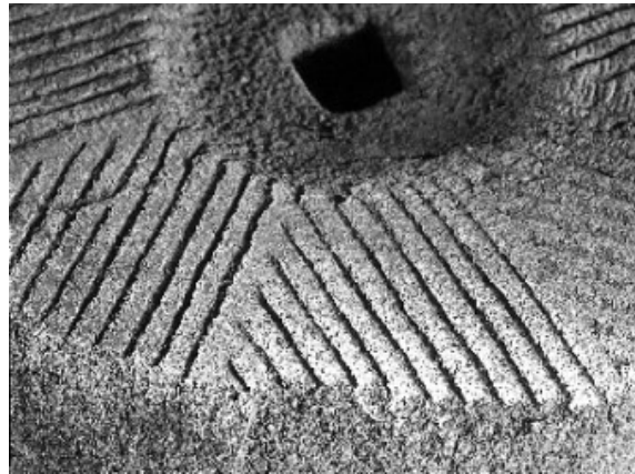
Figure 3. A millstone pattern found in the JangdoChonghaejin Historic Site

The circle of the millstone is active, with its limitless movements and endless rotations, and at the same time passive, having no particular directionality. We can feel endless space as well as totality from the centrosymmetric circle that does not incline toward any particular direction.