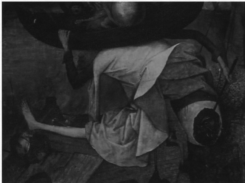
The Dukatenscheisser (detail from Dulle Griet ).