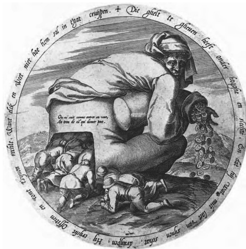
Pieter Bruegel the Elder (workshop), The Man with the Sack of Gold and his Flatterers . 1568. engraving. From R. van Bastelaer, Les Estampes de Bruegel l'Ancien (1904).