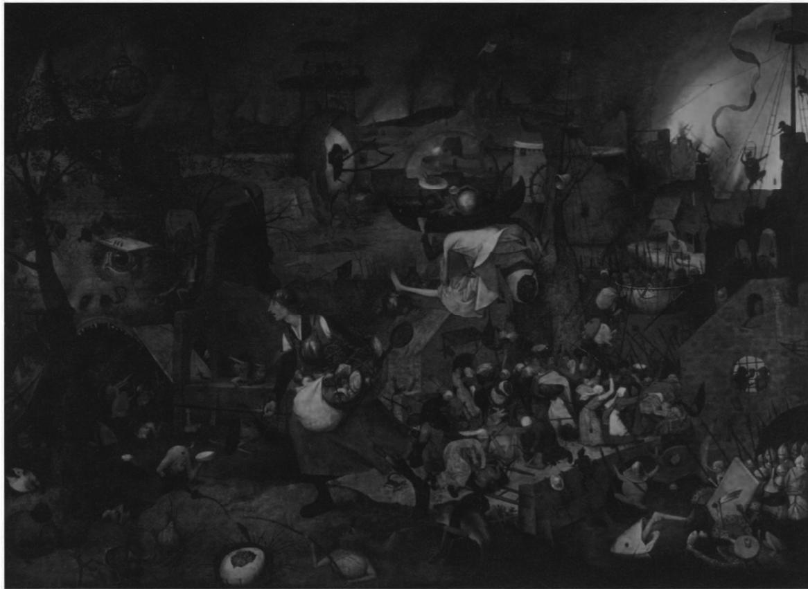
Pieter Bruegel the Elder, Dulle Griet . c.1562. Museum Mayer van den Bergh, Antwerp.

nations.’ 2 The Antwerp stock exchange, the Bourse, controlled the wealth of Europe, and in mid-century it was at the height of a boom. This boom was founded on new forms of credit, necessary to finance the high risks of sea-trading. The shift to credit allowed merchants to defer and interweave the consequences of their ventures, and citizens became used to the psychology of gambling on future profits. Like modern trading-floors, the Bourse was no sober club. Incidents of violence were not unknown and the building itself (new in 1531) was plagued by vandalism and graffiti. It was a centre for gossip and scandal of all kinds. ‘ He that will believe every nue that is blasted in Flanders among merchants shall have a mad head, ’ commented the English spy Stephen Vaughan to Thomas Cromwell in a dispatch of 1535.