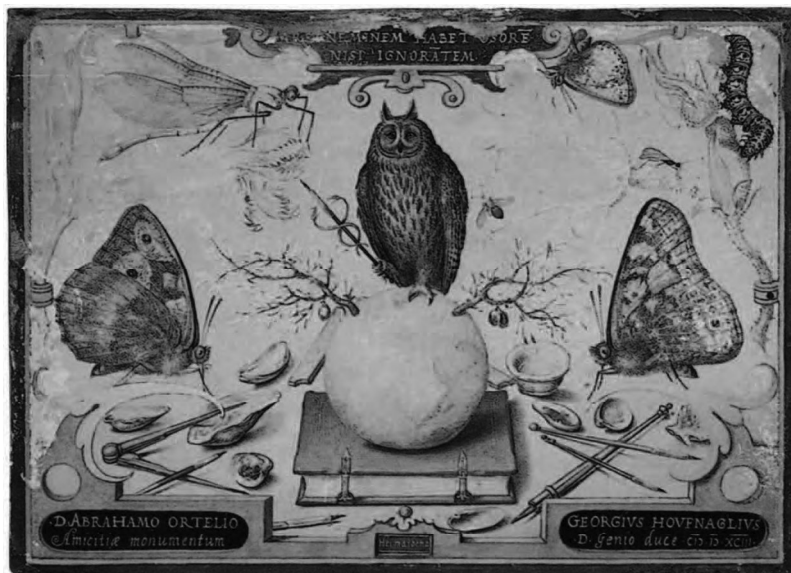
Joris Hoefnagel, Emblematic Composition in honour of Abraham Ortelius . 1593.

As in the broadsheets and farces, the Griet 's dominant images come from the fracturing world of folk culture. Echoes of sinister tales can be heard in the earliest description (1600) of the painting: ' A Dulle Griet, who robs in front of hell, wears a vacant stare and is (cruel, or) strangely and weirdly dressed. ' The proverb, ' to rob in front of hell ', referred to women who feared neither death nor the devil, and ' Dulle Griet ' was by extension a folk synonym for ' virago ' or ' bitch .' The fluid image of Griet could be woven